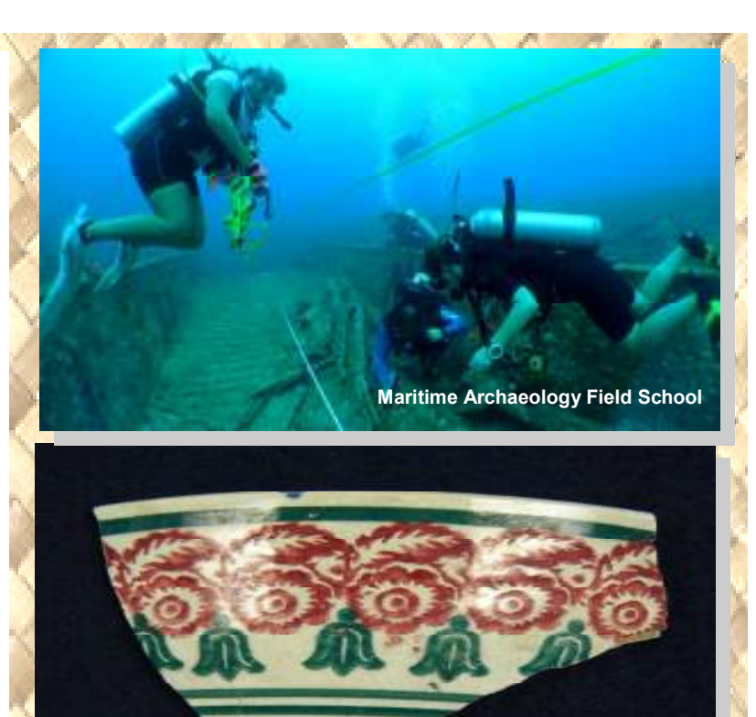
Rosario House Ceramic & Glass Catalog