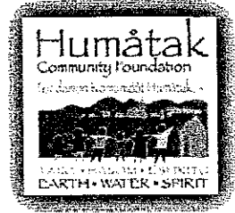
Humātak Community Foundation