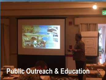
Public Outreach & Education