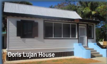
Doris Lujan House

The Guam Preservation Trust will preserve and protect Guam's historic sites, culture, and perspectives for the benefit of our people and our future.