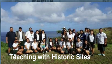
Teaching with Historic Sites