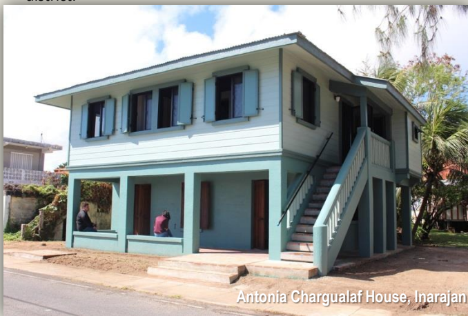
Antonia Chargualaf House, Inarajan