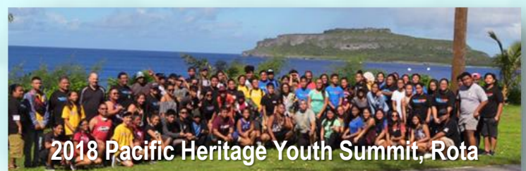
2018 Pacific Heritage Youth Summit, Rota

The Guam Preservation Trust presents its report as a testimony of the diligence and dedication of the Guam Preservation Trust Board of Directors, staff, and the preservation community in accomplishing this year's proposed outcomes and achieving the standards of success.