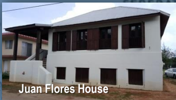
Juan Flores House