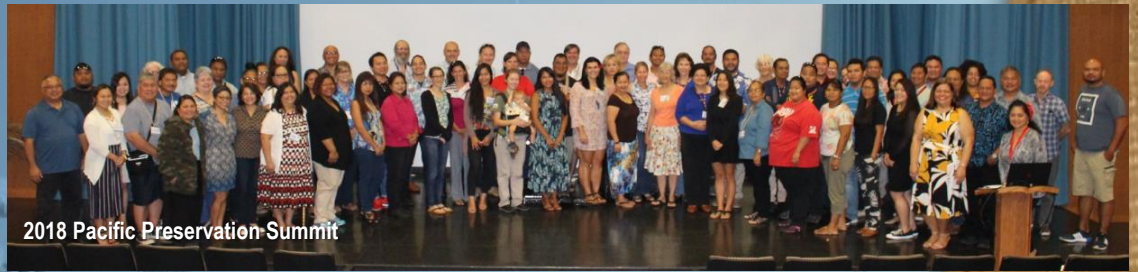
2018 Pacific Preservation Summit